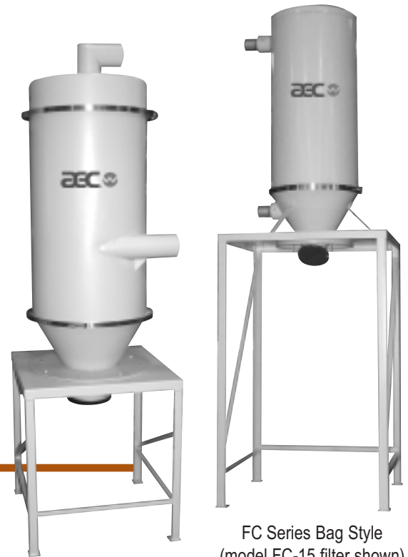
VFC Series Cartridge Style (model CFC-1000 filter shown)

The FC Series bag-style filter chambers are used with our APDB or VTPB power units with patented PulseJet™ Blowback for filter cleaning.